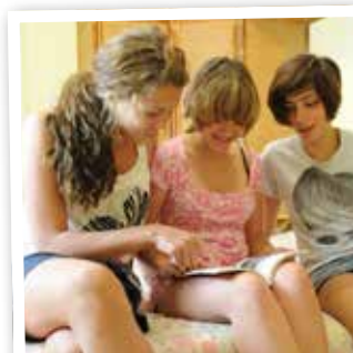
Keep learning with your host family