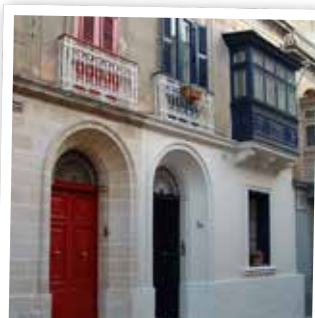
Traditional town house

2-hour bus ticket €1.30, day ticket €1.50, 7-day ticket €6.50, night single journey ticket (weekend only) €2.50 - subject to change