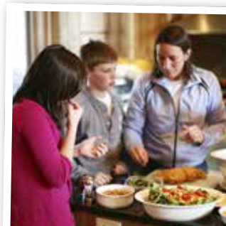
Enjoy warm Maltese hospitality